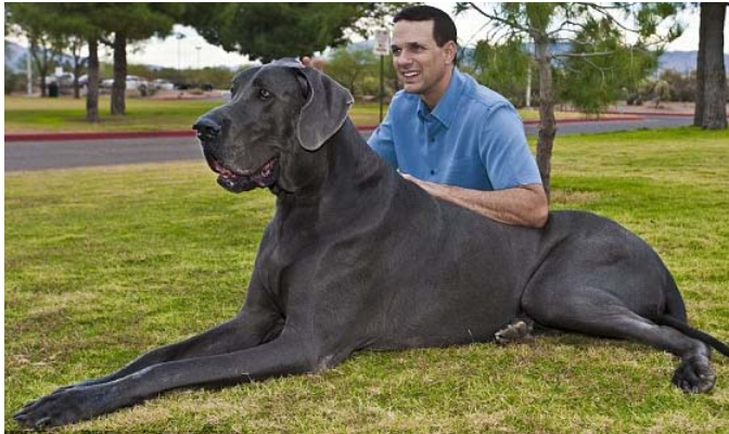
~World's Biggest Dog~ It's over 7 feet long!!!